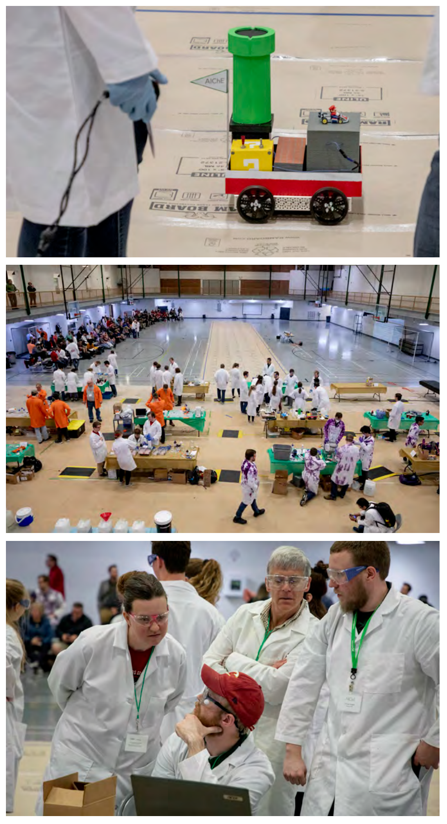
Above left: S&T Chem-E-Car Terry Cruise finished second out of 14 cars.

Top: S&T 's Glo-Kart finished third and won the Most Creative Car Deign Award. Glo-Kart was chosen to represent S&T's Chem-E-Car Design Team in the national competition in November.